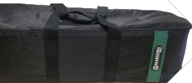
Optional carry case