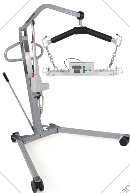
Suits most 'coathanger' sling support